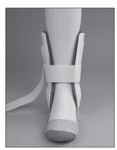
Figure 3 - Center side shells along ankle and leg