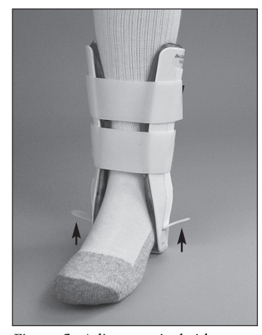
Figure 5 - Adjust vertical side straps