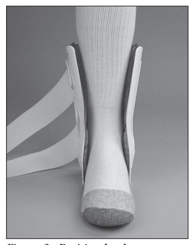
Figure 2 - Position heel on center pad