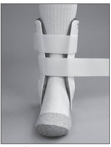
Figure 4 - Tighten lower and upper straps

E/U authorized representative MDSS GmbH Schiffgraben 41 D-30175 Hannover Germany