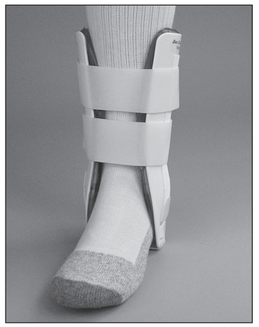
Figure 6 - Secure straps