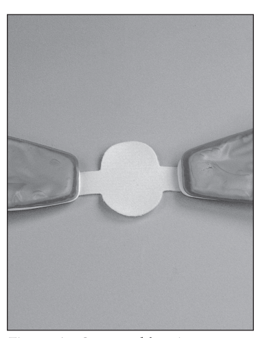
Figure 1 - Open ankle stirrup